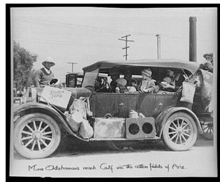
"Oklahoma dust bowl refugees. San Fernando, California." June 1935.

http://www.loc.gov/teachers/tps/quarterly/pdf/Summer2009ElementaryLevelLearningActivity.pdf